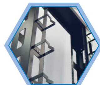
Metal Cable Ring

(Please kindly check with our sales for further requirements)