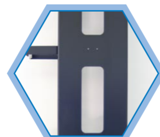
Multiple Cable Entrances