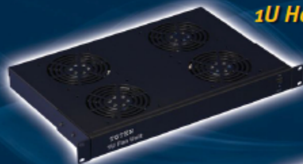
1U Hot Fix Fan Unit