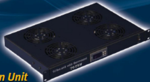
1U Hot Fix Thermostat Fan Unit