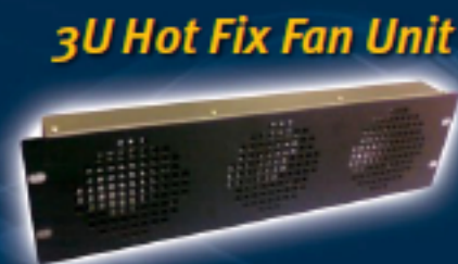
3U Hot Fix Fan Unit